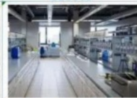
Application Lab Room