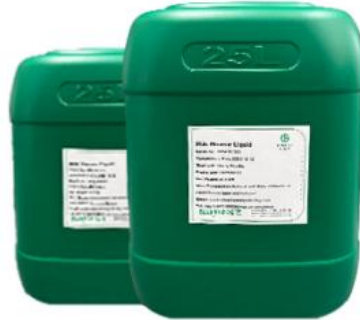
20kg / 25kg Barrel