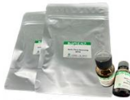
Powder package & Sample bottle