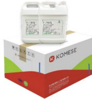
5kg *4/ Carton Package specification