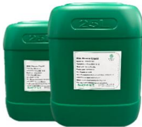
20kg / 25kg Barrel