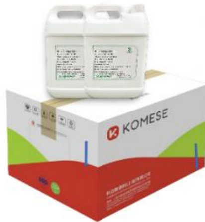
5kg *4/ Carton Package specification